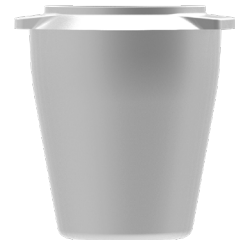
DOSING CUP 55GR